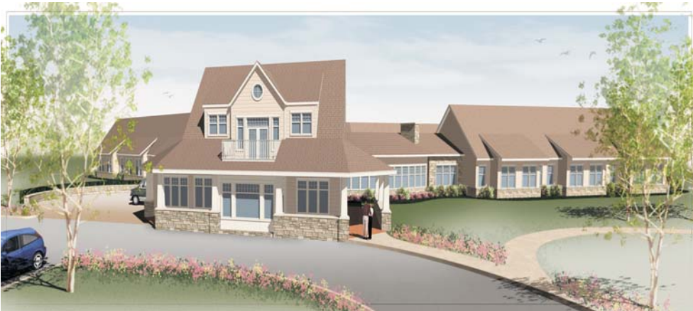
VNA Inpatient Hospice Opening Winter 2009/10