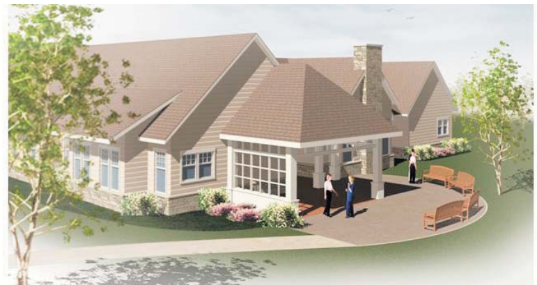
VNA Inpatient Hospice Patient/Family Veranda